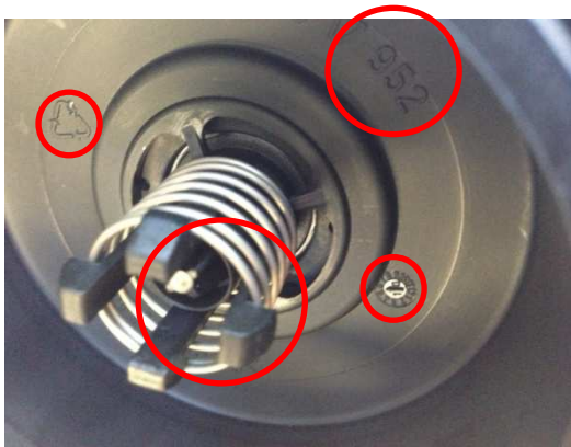
MANN+HUMMEL: Spring diameter fits latches, part number, date clock and recycling logo available