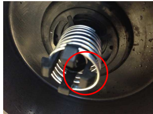
Copy: Spring diameter too big, unhooked on one side, no part number, no date clock, no recycling logo