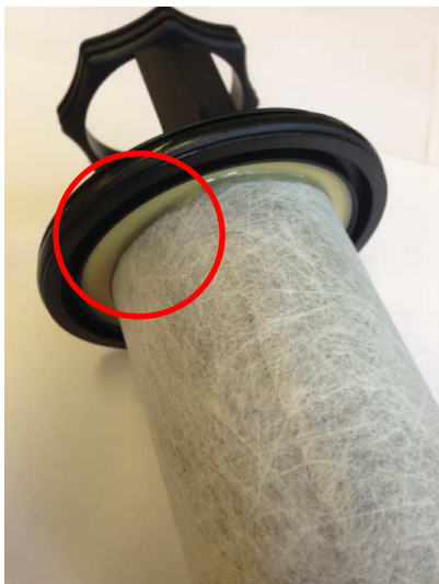
MANN+HUMMEL: Color of glue light beige, diameter of separator wrap 58mm