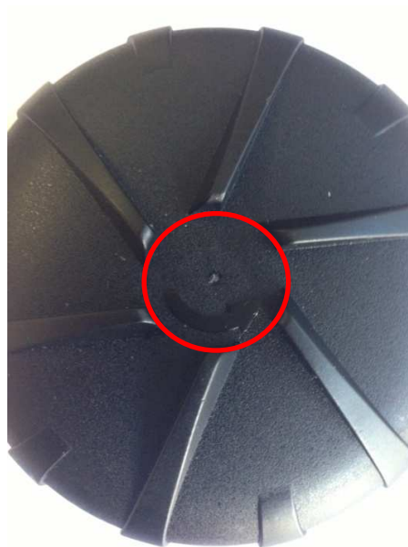
Copy: Arrow only on lid