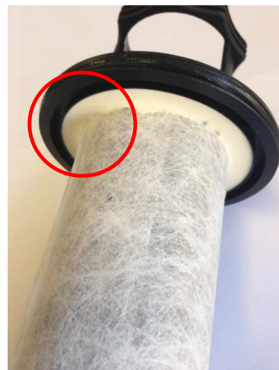
Copy: Color of glue white, diameter of separator wrap 53mm