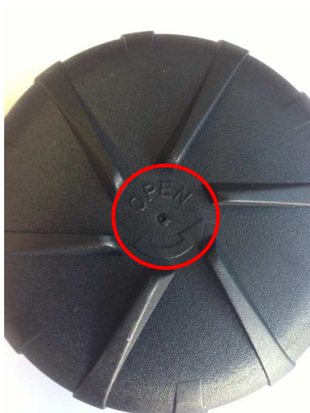
MANN+HUMMEL: "OPEN" written on lid plus arrow