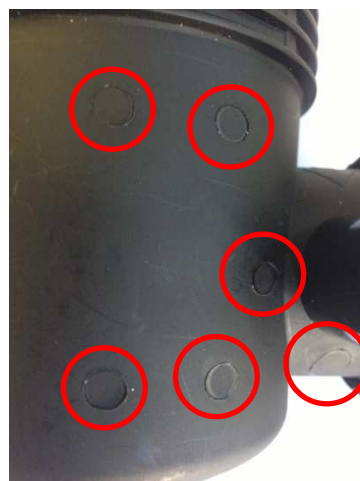
Copy: Tool ejector marks clearly visible