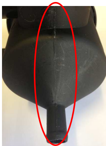
Copy: Re-worked tool separation line