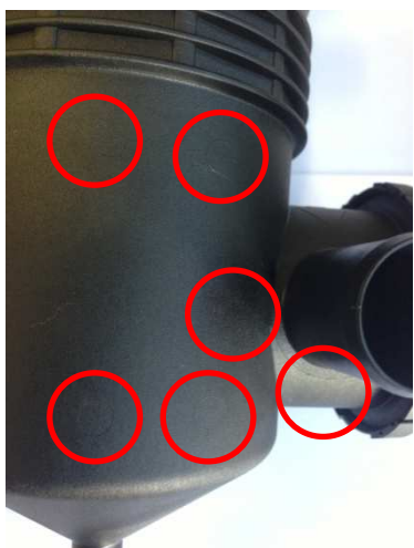
MANN+HUMMEL: Tool ejector marks almost invisible