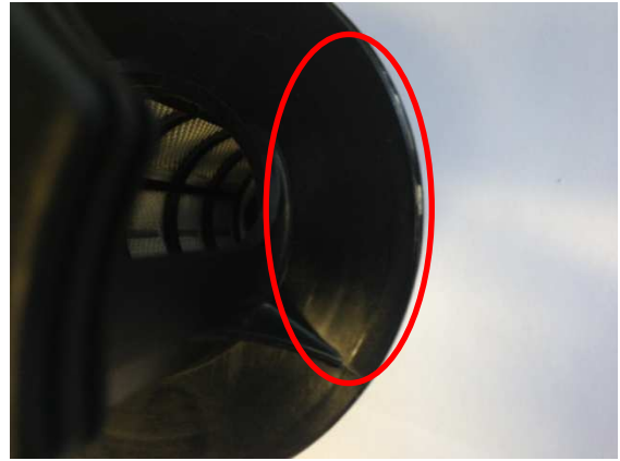
Copy: No part number on element