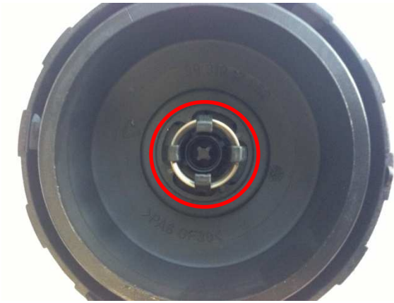
MANN+HUMMEL: Spring diameter fits latches