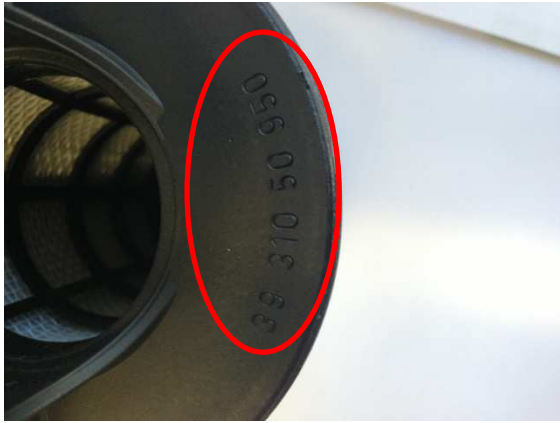
MANN+HUMMEL: part number on element